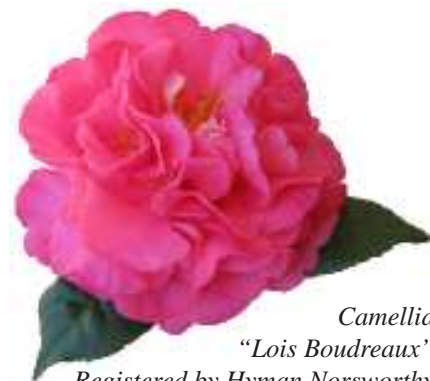
Camellia "Lois Boudreaux" Registered by Hyman Norsworthy featured on the 2007 Garden Tour brochure